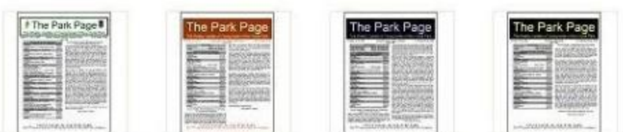
TheParkPage-46.pdf TheParkPage-47.pdf TheParkPage-48.pdf TheParkPage-49.pdf

The Park Page - Jubilee Commemorative Edition Young Israel of New Hyde Park 15 Marcheshvan 5768 * October 27, 2007