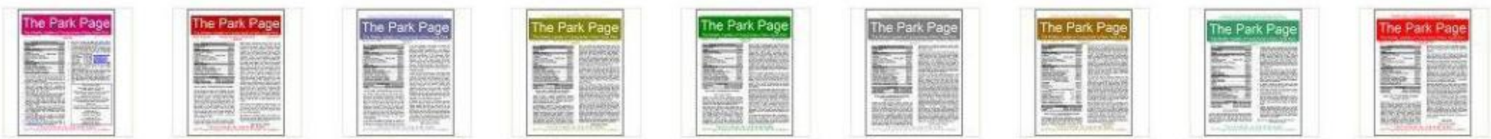
TheParkPage-10.pdf TheParkPage-11.pdf TheParkPage-12.pdf TheParkPage-13.pdf TheParkPage-14.pdf TheParkPage-15.pdf TheParkPage-16.pdf TheParkPage-17.pdf TheParkPage-18.pdf