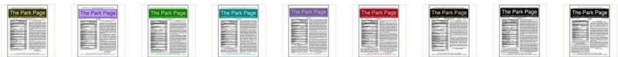
TheParkPage-37.pdf TheParkPage-38.pdf TheParkPage-39.pdf TheParkPage-40.pdf TheParkPage-41.pdf TheParkPage-42.pdf TheParkPage-43.pdf TheParkPage-44.pdf TheParkPage-45.pdf