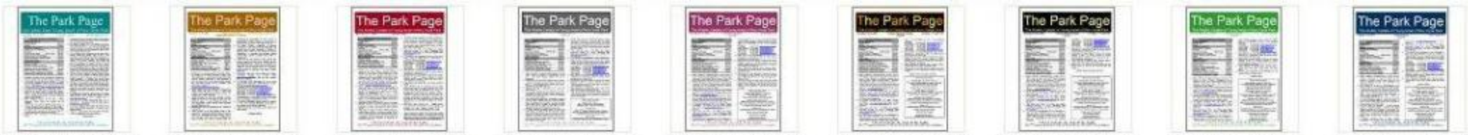
TheParkPage-01.pdf TheParkPage-02.pdf TheParkPage-03.pdf TheParkPage-04.pdf TheParkPage-05.pdf TheParkPage-06.pdf TheParkPage-07.pdf TheParkPage-08.pdf TheParkPage-09.pdf