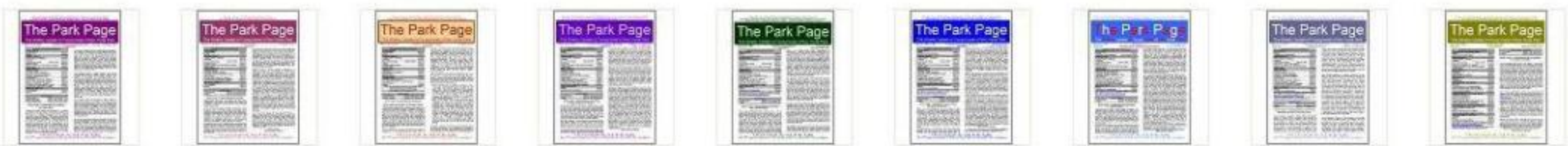
TheParkPage-19.pdf TheParkPage-20.pdf TheParkPage-21.pdf TheParkPage-22.pdf TheParkPage-23.pdf TheParkPage-24.pdf TheParkPage-25.pdf TheParkPage-26.pdf TheParkPage-27.pdf