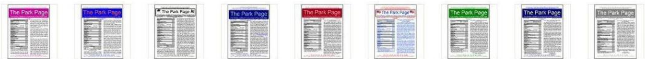
TheParkPage-28.pdf TheParkPage-29.pdf TheParkPage-30.pdf TheParkPage-31.pdf TheParkPage-32.pdf TheParkPage-33.pdf TheParkPage-34.pdf TheParkPage-35.pdf TheParkPage-36.pdf